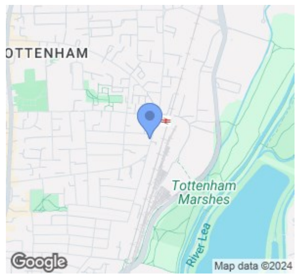
Illustration for identification purposes only, not in scale