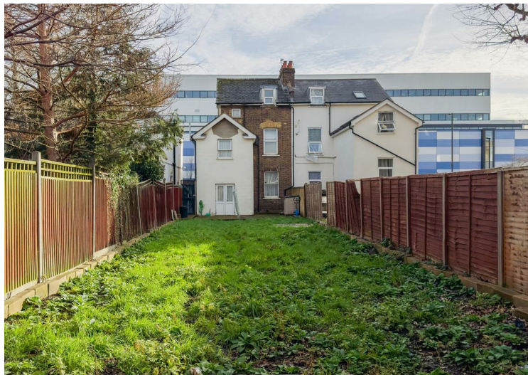
Illustration for identification purposes only, not in scale