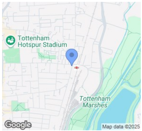
Illustration for identification purpose only, not in scale